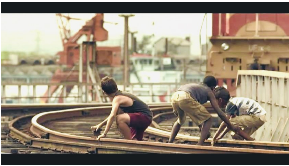
[Fig. 2]. Chala and friends using locomotive to flatten metal pieces. People nearby are oblivious to their dangerous activities ( Conducta 18:39).

invokes solidarity with the marginalized, but often falls short of practicing it. It does so by showcasing Carmela's exceptional classroom as an oasis of affection and academic rigor, from which her students leave bound for home, navigating precarious urban landscapes in their barrio (e.g. see Fig. 2). As a product of their comings and goings, the spectator is invited to reflect on a narrative that serves as counterpoint to that offered by official school policy, which mandates children's expulsion without providing effective alternatives for continuing their education.