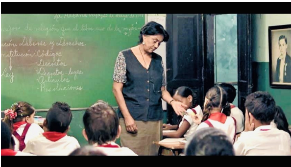
(Fig. 4). Carmela asks Yeni for the Virgin’s lithograph. Her action is in keeping with the list of rights and responsibilities written on the board ( Conducta 1:34:21).

Unable to put the matter to a satisfactory rest, a long shot shows Carmela walking to Yeni’s desk, extending her hand, while asking the girl for the card (e.g. see Fig. 4). The camera then shifts around 180 degrees to show in a long shot Carmela silently walking back to the back of the room and carefully placing the card on the same spot where Yeni had placed it originally. She then turns around to face her students, straining to see the Virgin’s card on the display board, and after a few seconds, she reminds them that it is time to check homework.