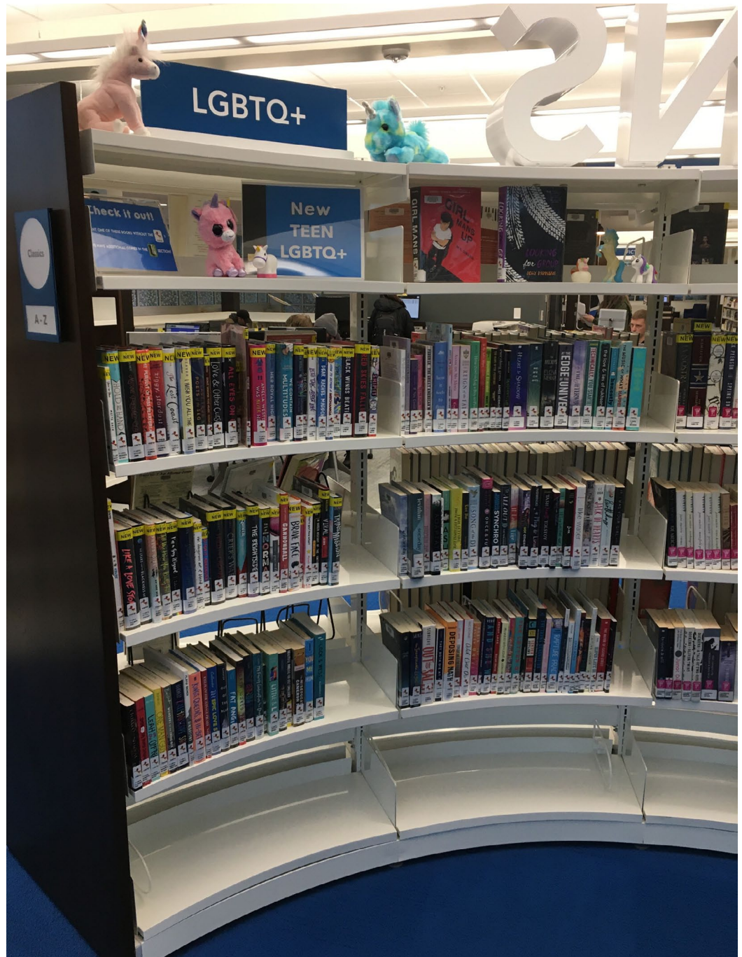
Our Teen LGBTQ section, adorned with unicorns for the article photoshoot, fills two shelves in the center of the library's Teen Area.

A note about terminology: For the sake of brevity, we use the word “teen” to describe LGBTQ youth throughout this article.