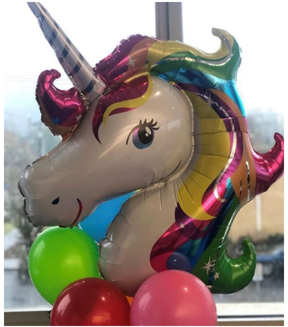
The exquisite rainbow unicorn balloon poses by the window during the Teen LGBTQ collection launch party.

Creating this collection would not have been possible without support at every level: feedback from the teens at TLR, a staff member who was passionate and knowledgeable about developing the collection, enthusiastic encouragement from library management, and