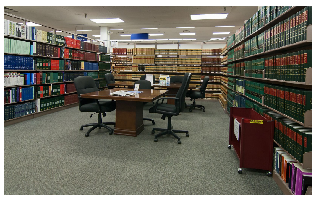
Interior view of KCLL.

One of the most well-received services that KCLL provides is pre-printed and stapled packets of court-sanctioned legal forms, including those for domestic relations matters (e.g., divorce, parenting plans, name changes), civil matters (e.g., tenant eviction, small claims), and probate (e.g., small estates). Offering these packets in the law library serves as a secondary access point for residents who may not be able to print the forms from home or purchase them at the courthouse during open hours. Fees are minimal and, although staff cannot assist patrons in filling out the forms, they can provide direction to specific resources and referrals that may help with completing necessary tasks.