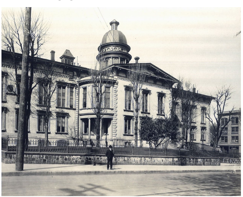
Old Multnomah County Courthouse circa 1900.

The first county law library in Oregon was Multnomah Law Library (MLL), which was incorporated in 1890 as a subscription library by a group of Oregon lawyers and set up inside the "Library Room" of the county courthouse (Multnomah Law Library: History, n.d.). By 1927, the Legislature had formally authorized the establishment of county law libraries: counties could pass a resolution declaring that they maintain and operate a law library "available at all reasonable times to the use of litigants, and permitted to be used by all attorneys at law duly admitted to practice in this state, without additional fees to such litigants or attorneys" (Or. Rev. Stat. § 9.840, repealed 2011), which directed the county clerk to collect fees for this purpose.