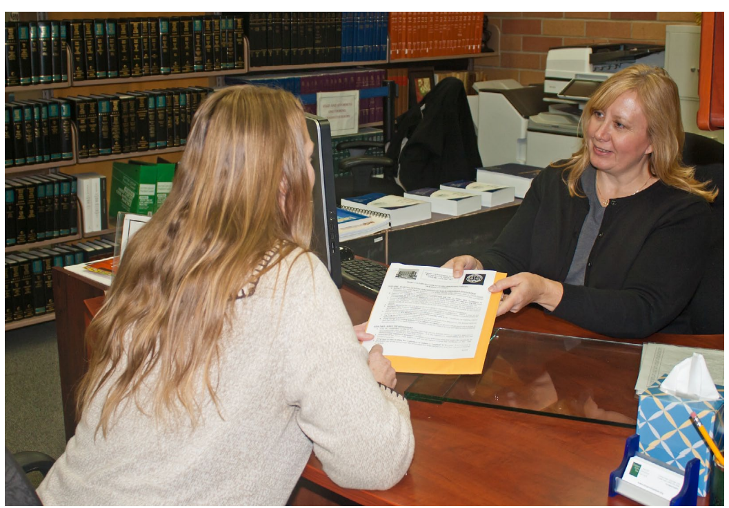
Patron and law packet at KCLL.

Most recently, KCLL has begun a "Lay Person Legal" public program series. The hourlong programs are held the third Thursday of select months in the public library meeting room and presented by local attorneys or Klamath County's Trial Court Administrator. The very first program, offered in spring 2017 on landlord/tenant law, drew a crowd of nearly 50 attendees! Other topics covered have included personal injury, marijuana law, and estate planning. The public library provides all of the promotion via local media, the library's newsletter, and publicity flyers in all branches of the KCLSD.