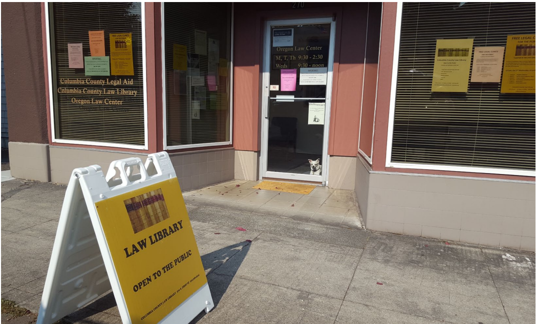
Front entrance of CCLL.

After water damage turned the 70-year-old Columbia County Law Library (CCLL), located in St. Helens, into a dark, moldy, unstaffed, and unused space, local attorneys pushed for revitalization. In 2014, county leaders hired an attorney and a resource librarian to plan the library's future, which ultimately included revamping the law library interior and upgrading equipment. Most significantly, CCLL adopted a new mission to become the legal resource center for all county residents, ensuring that everyone receives help regardless of economic means.