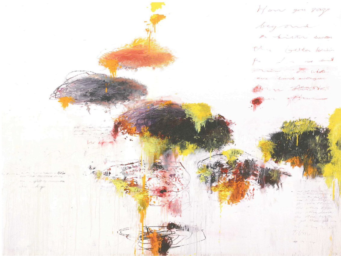
Figure 3. Cy Twombly, "Say Goodbye, Catullus, to the Shores of Asia Minor," 1994, Oil, acrylic, oil stick, wax crayon, and graphite pencil on canvas, 400 x 297 cm, Menil Collection, Houston.

Begun in 1972 and finished in 1994, "that big painting" as Twombly was fond of calling it, is made with almost all the materials in his toolkit: oil, acrylic, crayon, oil stick, pencil, and colored pencil. The right panel features dense and dripping bursts of bright oil and acrylic, reds, yellows, blacks, and purples with some wispy lines scrawled in colored pencil. In the central and largest of the three panels, the dense painted bursts become less concentrated, more tufts than bursts, dissipating as the penciled semi-cone like figure and blue smear gives way to the broad expanses of white canvas in which appears a white floating cottonball and some barely discernible ascending penciled script. Beyond that, nothing but some boats, crudely or abstractly rendered boats, drifting into the third panel increasingly cancelled or penciled over as they disappear into the vast