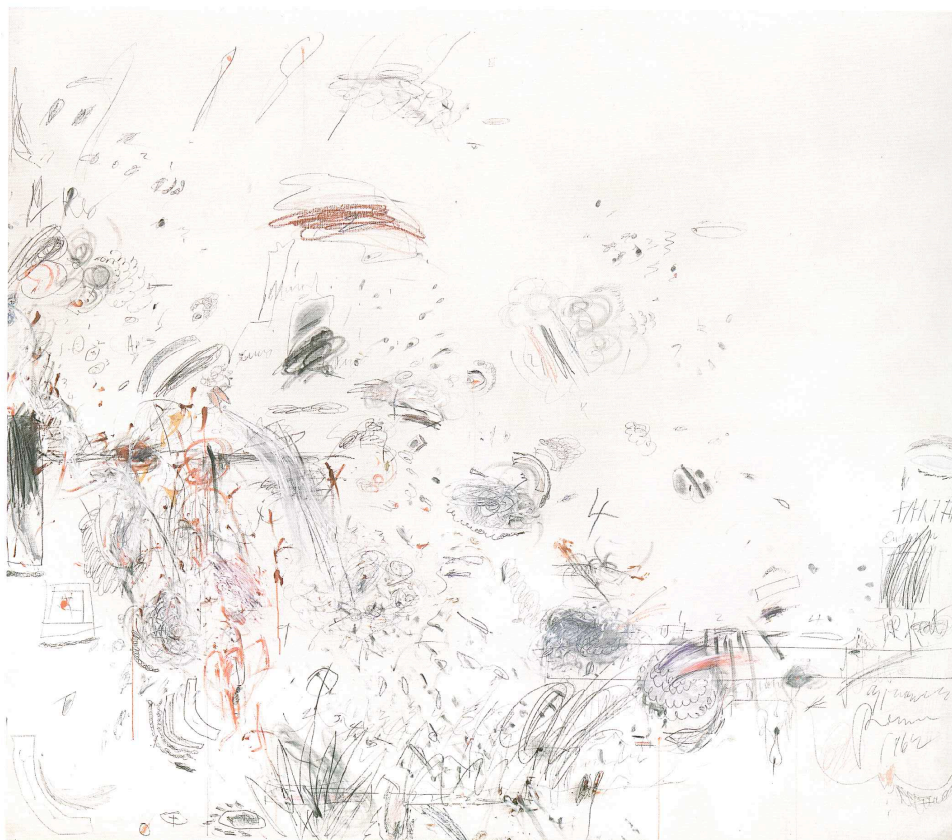
Figure 1. Cy Twombly, Hyperion (To Keats) , 1962, Oil, wax crayon and graphite pencil on canvas, 260 x 300 cm, Menil Collection, Houston.

Leaving aside Twombly’s work in sculpture, there are some recognizable phases and projects in the artist’s career: the massive totemic pictures, the geometric paintings often depicting numbers or numerical motifs, the series of lush green oil paintings on wood, the collages and word pictures, the grey “chalkboard” pictures covered with white loops that recall the Palmer handwriting method. But there is also a style of painting that Twombly began in the early 1960s and continued throughout his career. It is as distinctive as his signature; and it perhaps best conveys the “Twombly-effect.” One of the first of these paintings, finished in 1962, is called Hyperion (To Keats) , addressed to the poet’s great fragmented Hyperion epics.