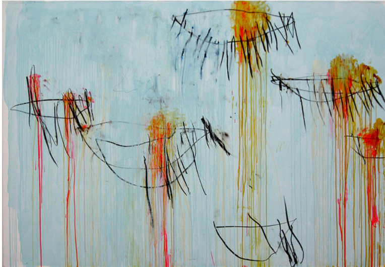
Figure 4. Cy Twombly, Lepanto , 2001, Acrylic, wax crayon and graphite on canvas, 215.9 x 334 cm (Exhibited at Gagosian Gallery, Winter 2002).

expanse of canvas. I have reproduced one final image, from Twombly's Lepanto series, which allows one to see more clearly what the boats look like.