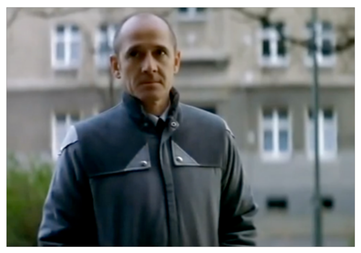
Image 4: Wiesel metamorphoses into a kind of "representative" Stasi figure as true evil is pushed ever higher up the hierarchical ladder. (Still from Das Leben der Anderen).<sup>30</sup>

In this way, the film can have it both ways: it rehabilitates an unknown quantity of Stasi personnel while unambiguously condemning the institution as a whole for unvarnished cruelty of the kind that leads to the suicide of the blacklisted playwright and composer, and the death of the young actress and love interest, Christa-Maria. In this case, too, the film clearly builds on the events of 1989, but in a manner that fairly overtly renders it allegorical and thus transferable to other times and settings.<sup>31</sup> But while it may broadly affirm the "humanity" of the central trio, and thus traffick in kitsch, it also seeks to rescue something more specific: the "good Marxism" of Brecht and Dreyman—that is, a Marxism that provides the film's strongest, internal critique of the brutal police state. Remember that Dreyman writes his surreptitious copy for Der Spiegel from the perspective not of a defector, but of a reformist Marxist.