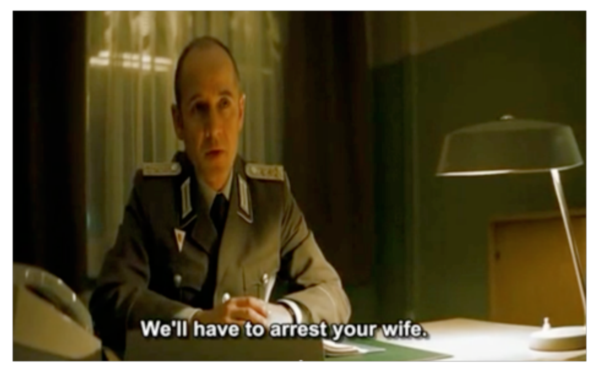
Image 2: Wiesler's multiple transformations (from hardened Stasi officer to vulnerable figure to hero-rescuer) exemplify the larger "redemptive" mission of Das Leben der Anderen. (Still from Das Leben der Anderen.).<sup>25</sup>

young Stasi recruits how to conduct an interrogation that truly intimidates prisoners.