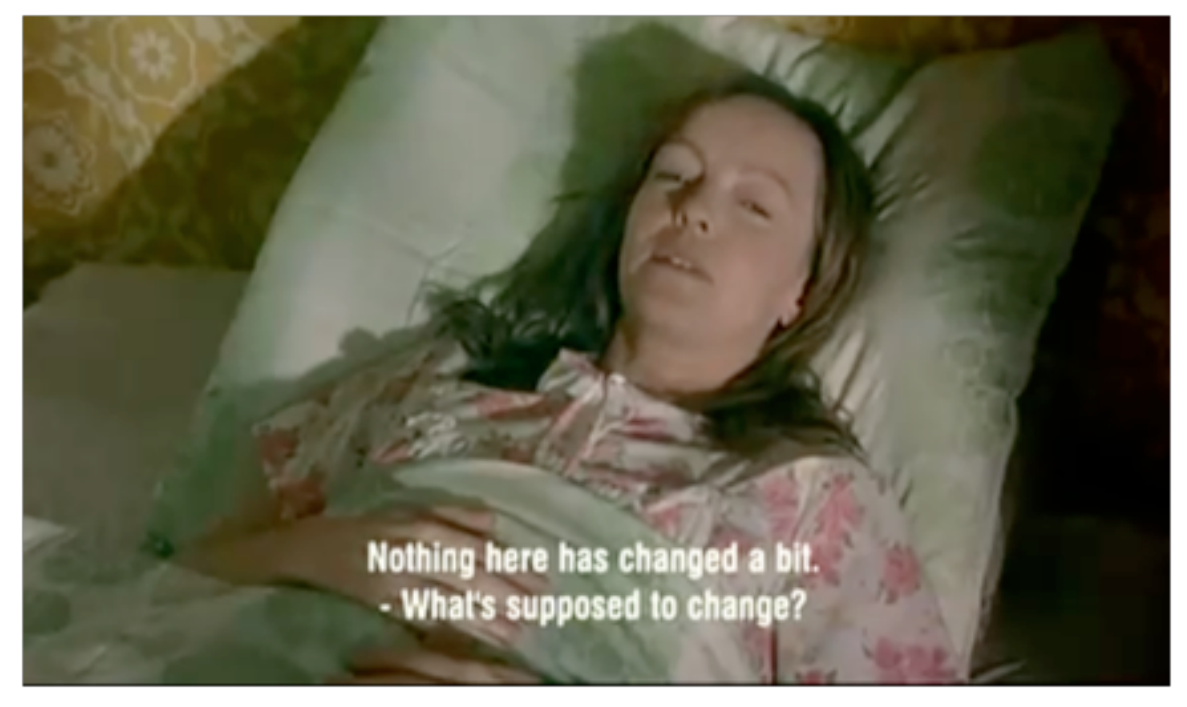
Image 1: Christine awakes from her coma after Unification: As a multiple victim, viewers are not inclined to reflect upon the potential deleterious effects of her life-long collusion with the SED. (Still from Good-bye Lenin!).<sup>22</sup>

authoritarian regime because she is portrayed as a multiple victim—first of her husband (who, as it appears for much of the film, abandoned her and their children and then remarried), then of the Party (which never lived up to its ideals), and finally of fate itself. We are simply not inclined to assign blame to a woman who lies in a coma only to wake from it with terminal heart disease.