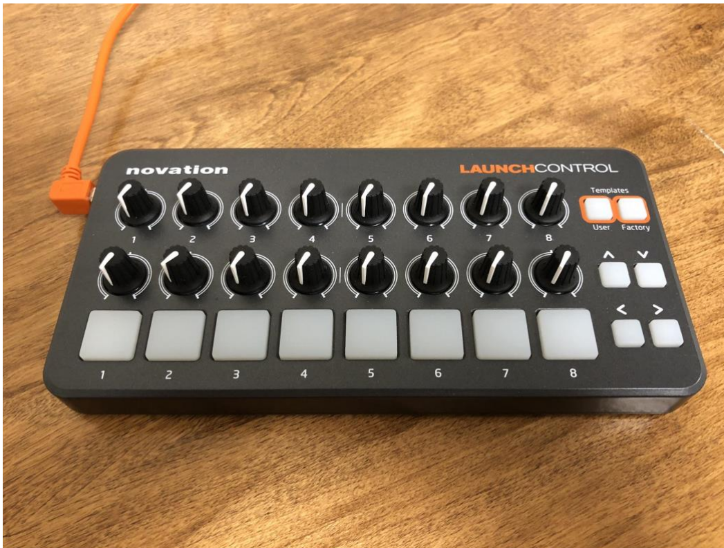
Figure 1. Novation Launch Control MIDI controller.

a Waterville map and then use this as a canvas in what it calls “Presentation Mode,” a curated view of what the programmer wants to display of a particular patch.