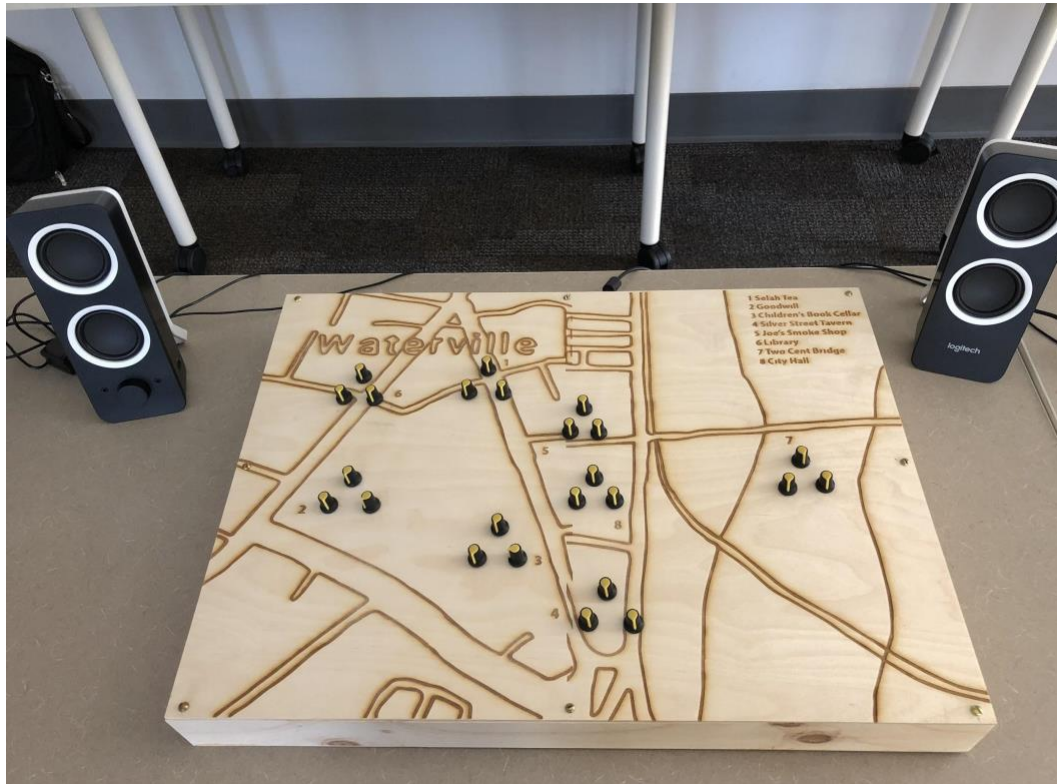
Figure 4. Interactive map combining digital and analog media.

That signal is then passed to a laptop running Max/MSP. Having already guided students through creating their Max soundscapes, we encouraged a team of students to design and build an actual wooden map that would be playable in much the same way. Since mounting a manufactured MIDI controller, like a Launch Control, into a map would severely limit the look and feel of the project, we decided to see if we could build our own controller with an Arduino microcontroller board, which would allow us to place pots or buttons at any location. We started by trying to replicate the button and two pots of a single Launch Control column. Using a breadboard for prototyping, we wired a button and a resistor to a digital input and two pots to analog inputs on the Arduino Uno board (fig. 5). We then wrote a short C++ program to make these output the appropriate MIDI messages. Since the Arduino had to connect to a computer using a USB cable, instead of a dedicated, five-pin MIDI cable, we used the open source software, Hairless MIDI, as a bridge to get the MIDI output from the Arduino to Max via USB (fig. 6).