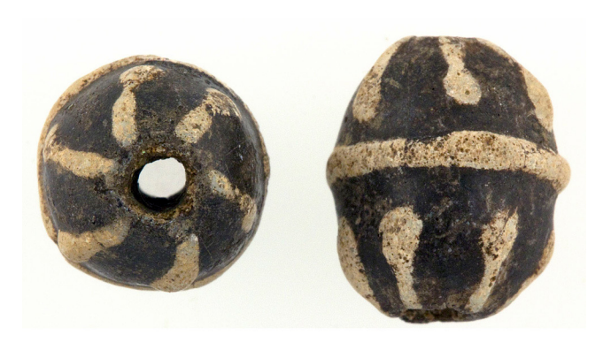
Figure 5. Type 4 from the Kleinburg ossuary (photo: John Howarth; courtesy of Archaeological Services Inc., Toronto).

The Culbertson and Adams sites are assigned to the period 1570-1590, based on a revised chronology for Seneca sites in western New York (Sempowski and Saunders 2001:6). They were previously attributed to the 1560-1575 period (Wray et al. 1987:115, 211). The nearby Factory Hollow site is dated to 1610-1625 (Sempowski and Saunders 2001:5), while the Barker site in eastern New York was occupied from about 1600 to 1614 (Bradley 2007:43). The date for the Funk Site in southeastern Pennsylvania is 1550-1600 (Smith and Graybill 1977:57).