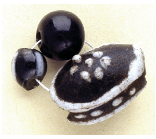
Figure 4. Type 1 with associated beads from Tadoussac, Quebec (cat. no. M2185A [detail]).

1993:70), though Loewen (2016:276, 284) feels that fritcore beads could have been introduced into the general region (Acadia and Tadoussac) from France as early as 1559. Thus, the beads from the three Quebec sites might also have arrived this early.