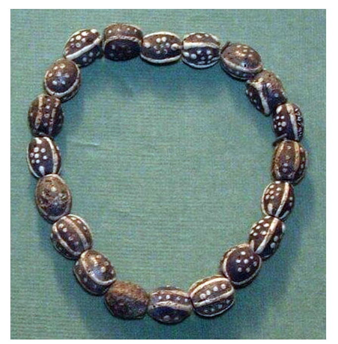
Figure 3. Frit-core beads from the Adams site, New York, showing Types 1, 2, and 5 (on loan to the Rochester Museum and Science Center; courtesy of the Rock Foundation).