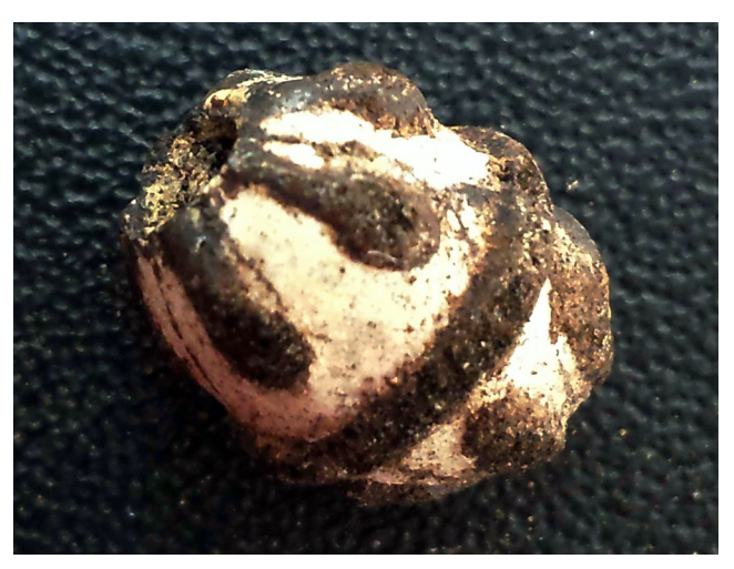
Figure 6. Type 4A from Jamestown, Virginia (photo: Bly Straube; collection of the Jamestown Rediscovery Foundation).

The Jamestown specimen is the only one found in a tightly dated context. It was recovered from the well John Smith ordered the colonists to dig in 1608, which was filled in upon the arrival of Lord De La Warr in 1610 (Merry Outlaw 2016: pers. comm.). This find confirms that frit-core beads spill over into the first decade of the 17th century. Thus, while the 1580-1600 date range is viable for frit-core beads in southern Ontario, it seems to be a bit restrictive for some of those found elsewhere. A more accurate date range for beads recovered from sites outside southern Ontario might be 1560-1610 or even later.