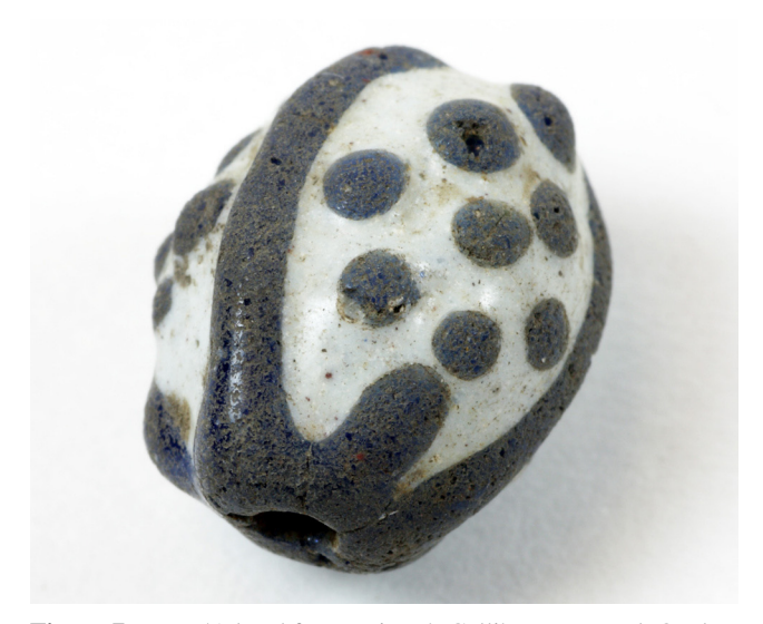
Figure 7. Type 5A bead from Pointe-à-Callière, Montreal, Quebec.

The Jamestown specimen is the only one found in a tightly dated context. It was recovered from the well John Smith ordered the colonists to dig in 1608, which was filled in upon the arrival of Lord De La Warr in 1610 (Merry Outlaw 2016: pers. comm.). This find confirms that frit-core beads spill over into the first decade of the 17th century. Thus, while the 1580-1600 date range is viable for frit-core beads in southern Ontario, it seems to be a bit restrictive for some of those found elsewhere. A more accurate date range for beads recovered from sites outside southern Ontario might be 1560-1610 or even later.