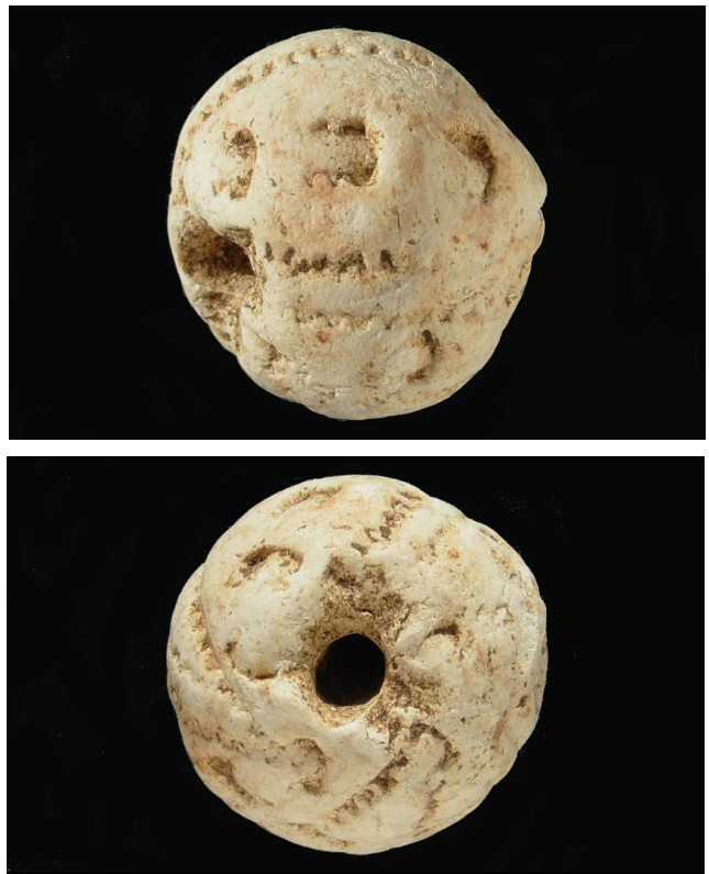
Figure 3. Bead 2, side and end views.

Bead 2 was found close to a deposit of pipes by Richard Greenland (1633/1640-1710), and although it could theoretically date from anytime between 1660 and 1710, it is more likely to be of a similar date to the other three. Beads 3 and 5 were associated with pipes made by Jeffry Hunt of