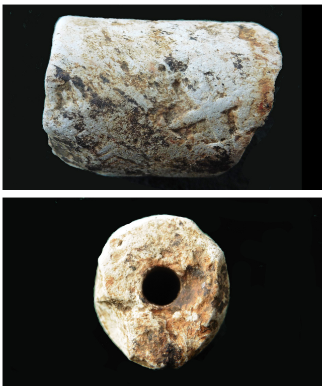
Figure 6. Bead 5, side and end views.

Norton St Philip (1599-1690), and can be dated to between 1670 and 1690. Bead 4 was associated with pipes made by both Jeffry Hunt and Richard Greenland and is probably also of the 1670-1690 period.