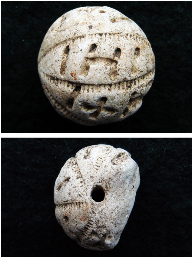
Figure 2. Bead 1, side and end views.

Bead 4 (Figure 5), the largest one to date, is cylindrical with slightly rounded ends and decorated with a combination of milling and staple designs from the same tools used to decorate Bead 3. The eight lines of milling gently spiral about the bead. Between each line is a series of three or four lines of parallel staples. Additional staples spiral around the ends, while five staples are arranged across the axis on one side. The bead is 32 mm long, 13 mm in diameter with a hole diameter of 2.8 mm. It was found in a part of what was once the medieval South Field, where the softer soil has been kinder to its condition.