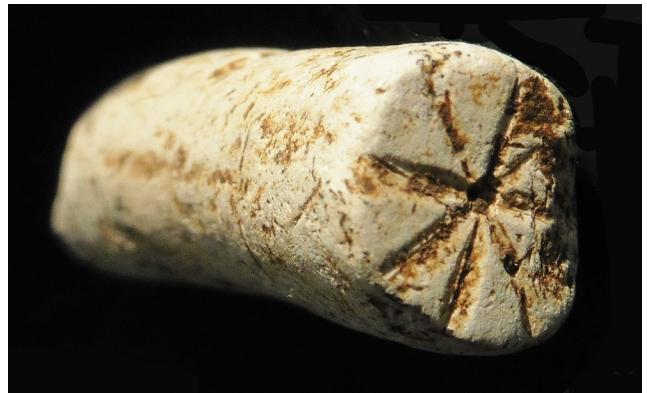
Figure 1. Stamp with wheel-spoke design (all photos by author).

Bead 1 (Figure 2) is incomplete but was spherical originally. The design consists of seven bands of milling which stretch from end to end, interspaced with “staples,”