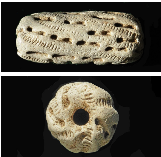
Figure 5. Bead 4, side and end views.