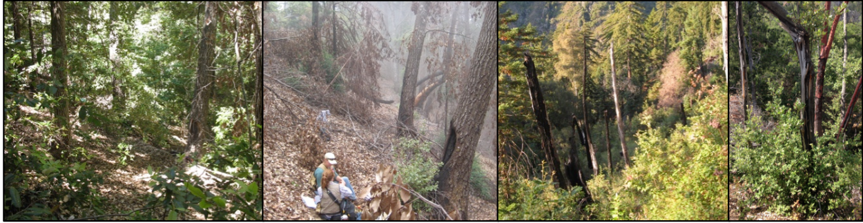
Figure 3: From left to right: (i) redwood-tanoak stand in 2006 in Big Sur, CA, infested with Phytophthora ramorum . (ii) Same stand in 2009, shortly after the 2008 Basin Fire. (iii) In 2013, after 5 years of post-fire growth; top-killed tanoak, redwood, and bay laurel trees in this same site vigorously resprouted. (iv) top-killed tanoak resprouts at a P. ramorum infested site in 2014.

Depending on the outcomes of these potential interactions, increased aboveground and belowground tree mortality could have important consequences for post-fire regeneration trajectories. Opportunities for tree seedling and shrub recruitment are often limited by competition from surviving trees and post-fire resprouters (Clarke et al. 2013; Clarke and Knox 2009; Higgins, Flores, and Schurr 2008). Compared to uninfested burned areas, stand density and canopy cover will be reduced in areas impacted by both SOD and fire, due both to pre-fire disease and potential disease-fire interactions. This reduced competition may generate unique opportunities for tree or shrub species regenerating from seed (e.g., Ceanothus spp.) or cause shifts in plant composition or opportunities for invading plants. In particular, altered patterns of shrub recruitment could have important consequences for understory competition, forb and herb diversity, and future potential fire behavior as sites dominated by shrubs may generate a characteristically short and dense profile of fine fuels, compared to intact forests (Ottmar et al. 2007). Further, the observed post-fire differences in nutrient dynamics (Cobb et al. 2016) between SOD-impacted and disease-free sites may also alter competitive dynamics and community assembly.