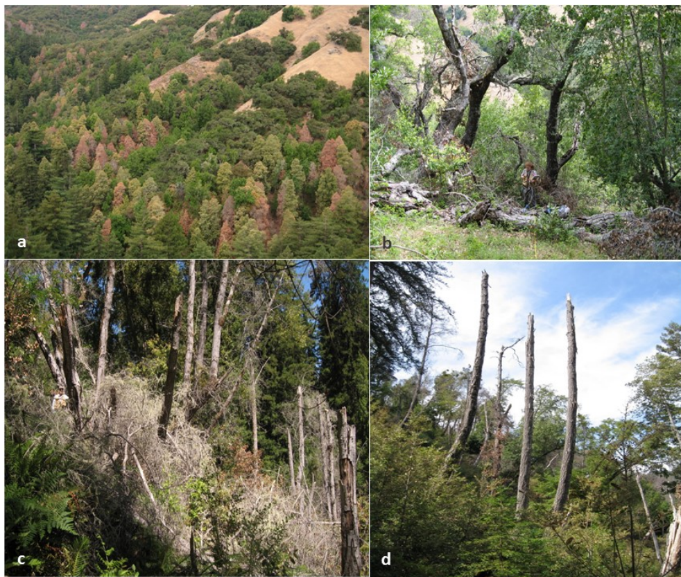
Figure 2. SOD-created fuels vary with disease stage and forest type: (a) landscape in early stages of SOD infestation, with standing dead tanoaks retaining dead foliage; (b) Mixed-evergreen forest dominated by coast live oak in late-stage of SOD infestation; (c) Mid-stage SOD infestation with impenetrable heavy fuels on the ground and many standing dead trees; (d) Late stage SOD infestation with snags and resprouting tanoak creating brushy conditions that hide ground fuels.

infested stands as the same measure observed in uninfested stands (assumed to represent background mortality rates for these species) for mixed-evergreen and redwood forest types, respectively (Metz et al. 2011). In coast redwood forests from Big Sur to Sonoma County the mean mass of tanoak coarse woody debris was approximately 10 to 100 times greater in diseased stands than disease-free stands (22.4 vs. 0.27 Mg ha -1 for standing snags and 11.5 vs. 1.16 Mg ha -1 in large logs, 1,000 hr fuels) with slower rates of accumulation than with pulse disturbances such as a fire or harvesting (Cobb et al. 2012a). In the mixed-evergreen oak woodlands of the San Francisco Bay Area, there were 5.7 times as many dead coast live oak stems in areas of SOD-related mortality compared to intact stands, resulting in 1 h, 10 h, and 100 h fuel masses that were nearly doubled in these plots while 1000 h fuels were nearly 20 times that of intact forests (Shaw et al. 2017). Douglas-fir- and redwood-dominated forests invaded by P. ramorum in Point Reyes National Seashore, just north of the San Francisco Bay area, had roughly 2.5 times the 1 h, 10 h, and 100 h fuels as healthy forests (Forrestel et al. 2015). Fuels continued to increase over the four year period of the study, such that the depth of the fuel bed in diseased stands was four times as deep as in healthy stands (Forrestel et al. 2015).